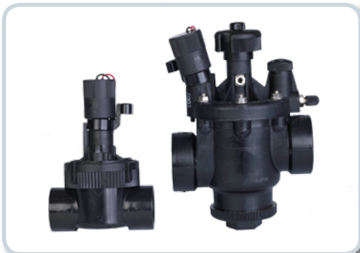
EZ-Flo® and P-220 valves shown with the DCLS-P Latching solenoid which provide cost and labor savings.