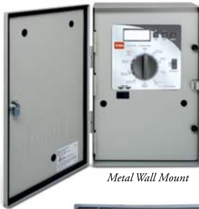
Metal Wall Mount

The Toro Custom Command delivers. With the highest surge protection in its price range, options from 9- to 48-stations, metal or plastic enclosures, and a 5-year warranty, it defines the term "Commercial Grade."