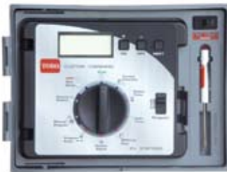
Plastic Wall Mount