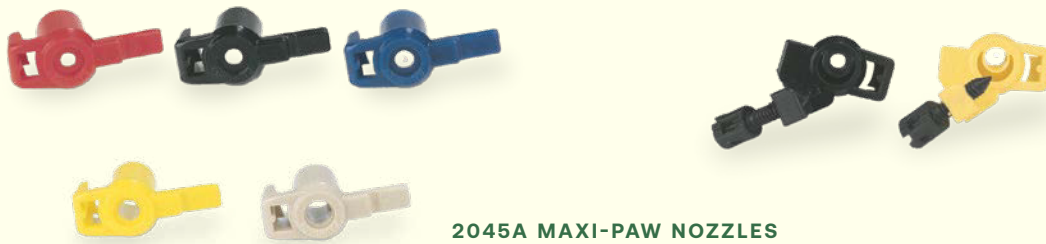
2045A MAXI-PAW NOZZLES

Performance data derived from tests that conform with ASAE Standards; ASAE S398.1.