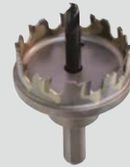
Industrial Carbide-Tipped Hole Saws Available See pg. 107

Special alloy tip for longer cutting life in stainless steel