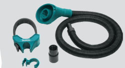
196571-4 Dust Extraction Attachment, 1-1/8", Demolition