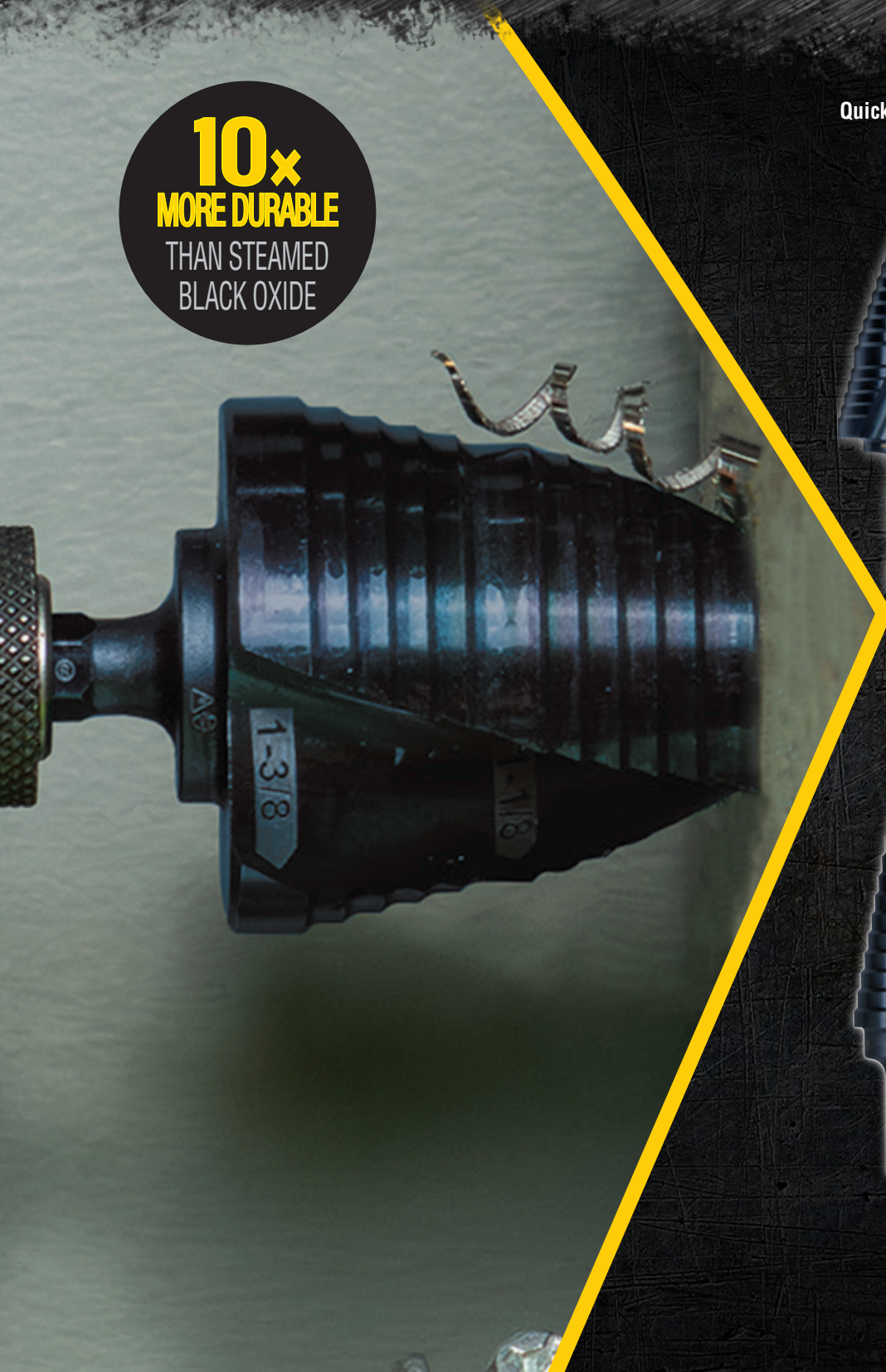
Quick-Release, 1/4" Hex with Dual Spiral Flutes

10x MORE DURABLE THAN STEAMED BLACK OXIDE