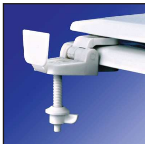
Corrosion proof, self-aligning hardware