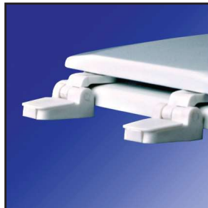
Factory-installed "living" hinge covers w/stainless steel screws