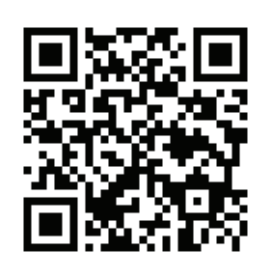
APPLE APP STORE

Download today from Apple or Google stores.