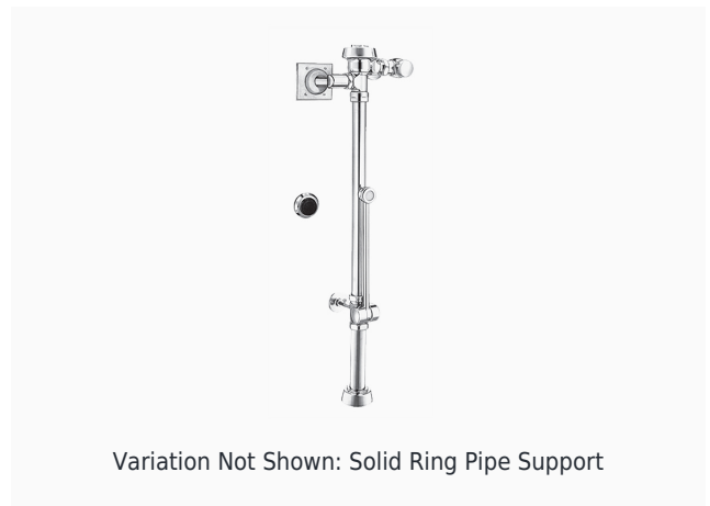
Variation Not Shown: Solid Ring Pipe Support