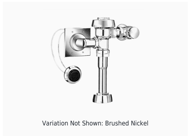
Variation Not Shown: Brushed Nickel