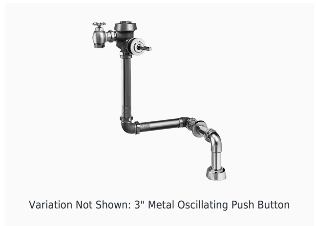
Variation Not Shown: 3" Metal Oscillating Push Button