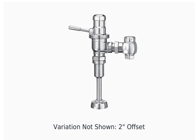
Variation Not Shown: 2" Offset