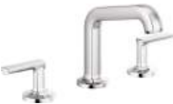
WIDESPREAD WITH ANGLED SPOUT AND LEVER HANDLES 65307LF-LHP, HL5306