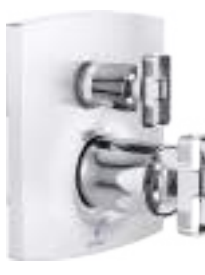
PRESSURE BALANCE VALVE WITH INTEGRATED DIVERTER TRIM AND KNOB HANDLES 3 FUNCTION: T75P506-LHP, HK75P06 6 FUNCTION: T75P606-LHP, HK75P06