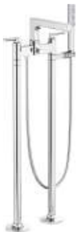
TWO-HANDLE TUB FILLER WITH LEVER HANDLES T70310-LHP, T70306