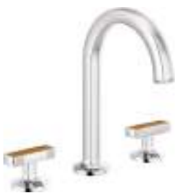
WIDESPREAD WITH ARC SPOUT AND KNOB HANDLES (WOOD INLAY) 65306LF-LHP, HI5306-WD