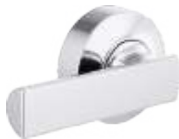
UNIVERSAL TANK LEVER 696306