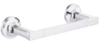
8" MINI TOWEL BAR 694706