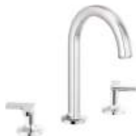
WIDESPREAD WITH ARC SPOUT AND CROSS HANDLES 65306LF-LHP, HX5306