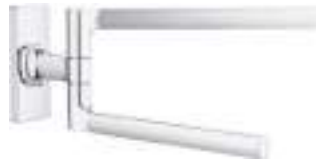
8" MINI PIVOTING TOWEL BAR 694707