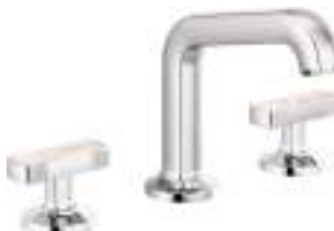
WIDESPREAD WITH ANGLED SPOUT AND KNOB HANDLES (MOTHER OF PEARL INLAY) 65307LF-LHP, HI5306-PL