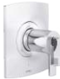
TEMPASSURE THERMOSTATIC VALVE ONLY TRIM WITH LEVER HANDLES T60006-LHP, HL6006