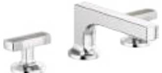
WIDESPREAD WITH LOW SPOUT AND KNOB HANDLES (CONCRETE INLAY) 65308LF-LHP, HI5306-CT