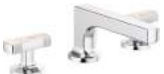
WIDESPREAD WITH LOW SPOUT AND KNOB HANDLES (MOTHER OF PEARL INLAY) 65308LF-LHP, HI5306-PL