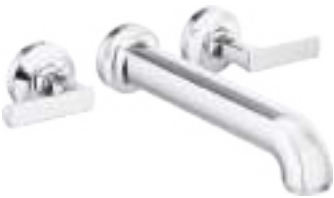
TWO-HANDLE WALL MOUNT WITH LEVER HANDLES T70406-LHP, HL70406