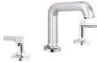
WIDESPREAD WITH ANGLED SPOUT AND CROSS HANDLES 65307LF-LHP, HX5306