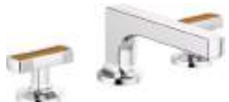
WIDESPREAD WITH LOW SPOUT AND KNOB HANDLES (WOOD INLAY) 65308LF-LHP, HI5306-WD