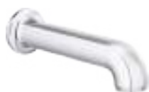
NON-DIVERTER TUB SPOUT 73606