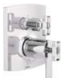
TEMPASSURE THERMOSTATIC VALVE WITH INTEGRATED DIVERTER TRIM AND KNOB HANDLES 3 FUNCTION: T75506-LHP, HK75506 6 FUNCTION: T75606-LHP, HK75506