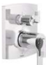
TEMPASSURE THERMOSTATIC VALVE WITH INTEGRATED DIVERTER TRIM AND LEVER HANDLES 3 FUNCTION: T75506-LHP, HL75506 6 FUNCTION: T75606-LHP, HL75506