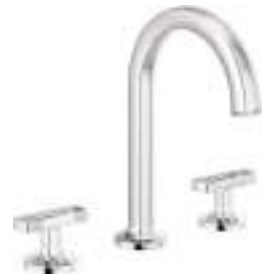
WIDESPREAD WITH ARC SPOUT AND KNOB HANDLES 65306LF-LHP, HK5306