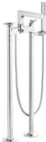
TWO-HANDLE TUB FILLER WITH CROSS HANDLES T70310-LHP, T70307