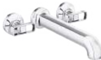
TWO-HANDLE WALL MOUNT WITH KNOB HANDLES T70406-LHP, HK70406