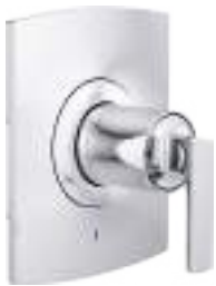
PRESSURE BALANCE VALVE ONLY TRIM WITH LEVER HANDLES T60P006-LHP, HL60P06