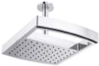
14" DUAL WATERWAY MULTI-FUNCTION RAINCAN SHOWERHEAD, SHOWN WITH 6" DUAL WATERWAY CEILING MOUNT SHOWER ARM AND FLANGE 81406-2.5, 83992-06MF ALSO AVAILABLE WITH 10" SHOWER ARM AND FLANGE