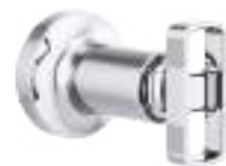
SENSORI VOLUME CONTROL WITH KNOB HANDLE T66606