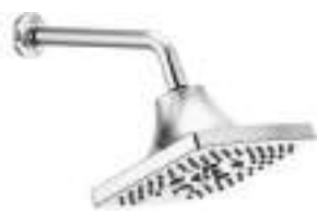
TEMPASSURE THERMOSTATIC SHOWER ONLY TRIM WITH LEVER HANDLES T60206-LHP, HL6006