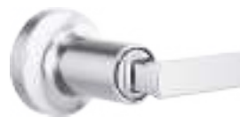
SENSORI VOLUME CONTROL WITH LEVER HANDLE T66606