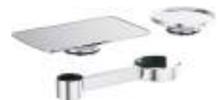
TUB FILLER ACCESSORIES 695506

AVAILABLE AS WALL MOUNT, FLOOR MOUNT, OR DECK MOUNT. SEE BRIZO.COM