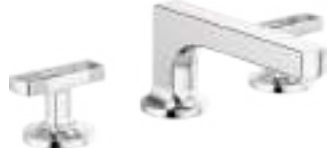
WIDESPREAD WITH LOW SPOUT AND KNOB HANDLES 65308LF-LHP, HK5306