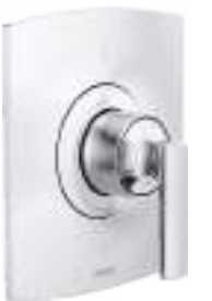
SENSORI THERMOSTATIC VALVE TRIM WITH LEVER HANDLE T66T006-LHP, HL66606