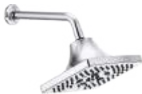
TEMPASSURE THERMOSTATIC SHOWER ONLY TRIM WITH KNOB HANDLES T60206-LHP, HK6006