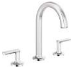
WIDESPREAD WITH ARC SPOUT AND LEVER HANDLES 65306LF-LHP, HL5306