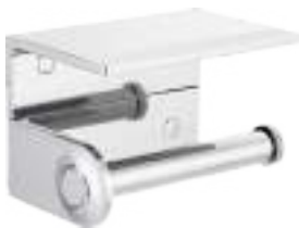
TISSUE HOLDER, SHOWN WITH OPTIONAL TISSUE HOLDER SHELF 695006, 695007