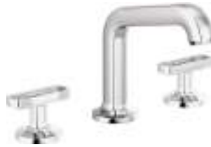
WIDESPREAD WITH ANGLED SPOUT AND KNOB HANDLES 65307LF-LHP, HK5306