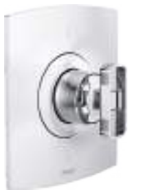
SENSORI THERMOSTATIC VALVE TRIM WITH KNOB HANDLE T66T006-LHP, HK66606