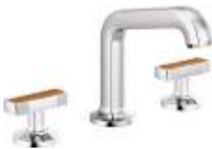
WIDESPREAD WITH ANGLED SPOUT AND KNOB HANDLES (WOOD INLAY) 65307LF-LHP, HI5306-WD