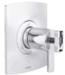
TEMPASSURE THERMOSTATIC VALVE ONLY TRIM WITH KNOB HANDLES T60006-LHP, HK6006