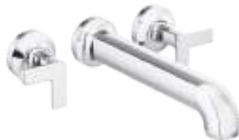
TWO-HANDLE WALL MOUNT WITH CROSS HANDLES T70406-LHP, HX70406