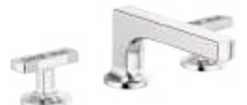
WIDESPREAD WITH LOW SPOUT AND KNOB HANDLES (CUSTOM INLAY) 65308LF-LHP, HI5306