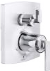
PRESSURE BALANCE VALVE WITH INTEGRATED DIVERTER TRIM AND LEVER HANDLES 3 FUNCTION: T75P506-LHP, HL75P06 6 FUNCTION: T75P606-LHP, HL75P06