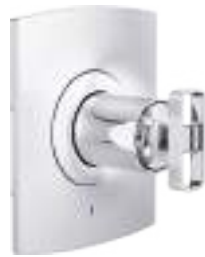
PRESSURE BALANCE VALVE ONLY TRIM WITH KNOB HANDLES T60P006-LHP, HK60P06