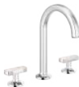
WIDESPREAD WITH ARC SPOUT AND KNOB HANDLES (MOTHER OF PEARL INLAY) 65306LF-LHP, HI5306-PL