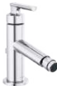
SINGLE-HANDLE BIDET 68106