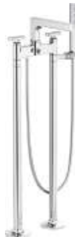
TWO-HANDLE TUB FILLER WITH KNOB HANDLES T70310-LHP, T70308