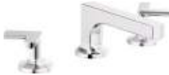
WIDESPREAD WITH LOW SPOUT AND CROSS HANDLES 65308LF-LHP, HX5306