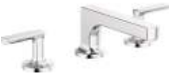
WIDESPREAD WITH LOW SPOUT AND LEVER HANDLES 65308LF-LHP, HL5306