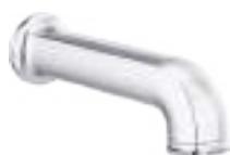
DIVERTER TUB SPOUT 73506