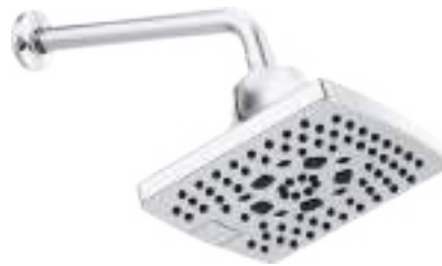
7" SQUARE H2OKINETIC MULTI-FUNCTION SHOWERHEAD, SHOWN WITH 10" WALL MOUNT SHOWER ARM AND FLANGE 87406-2.5, 83806