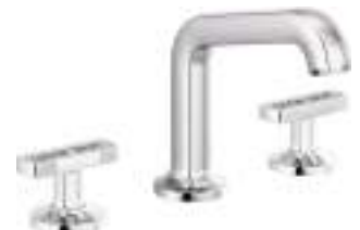
WIDESPREAD WITH ANGLED SPOUT AND KNOB HANDLES (CUSTOM INLAY) 65307LF-LHP, HI5306