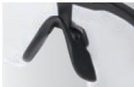
Flexible Nose Bridge