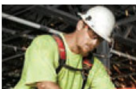
Anti-Scratch Hard Coat Protects Lenses