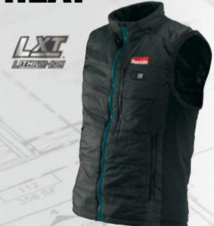
Vest only - battery and charger not included