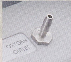
Metal Outlet Fitting