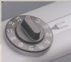
Lockable Flow Control Valve