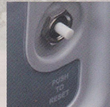
Resettable Circuit Breaker