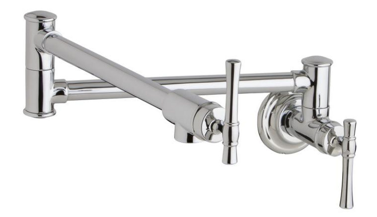
Lustrous Oil Rubbed Polished Steel (LS) Bronze (RB) Nickel (PN)

AMERICAN PRIDE. A LIFETIME TRADITION. Like your family, the Elkay family has values and traditions that endure. For almost a century, Elkay has been a family-owned and operated company, providing thousands of jobs that support our families and communities.