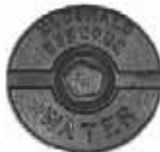
5607 Tapped 1"