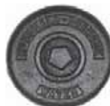
5614 Tapped 1 1/4"