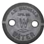
5601 Tapped 1" Erie Pattern