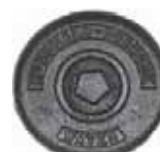
5623 Tapped 1 1/2"