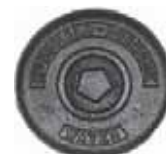
5623 Tapped 1 1/2"