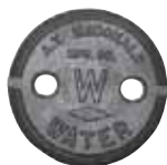
5601 Tapped 1" Erie Pattern