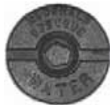
5607 Tapped 1"