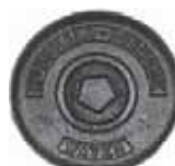
5614 Tapped 1 1/4"