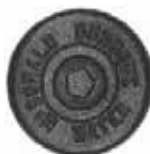
5624 Tapped 2"