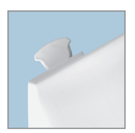
PLASTIC EASY•CLEAN & CHANGE® HINGES