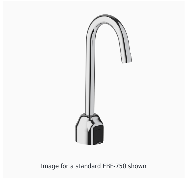
Image for a standard EBF-750 shown