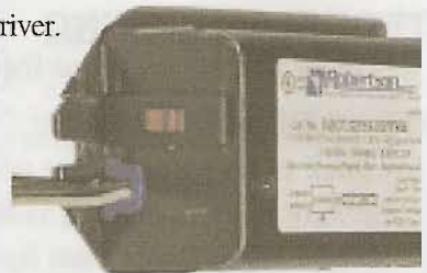
( Figure A )