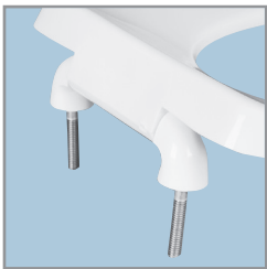
PLASTIC HINGES WITH STAINLESS STEEL POSTS AND PINTLES