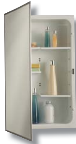
Modular Shelf 468MOD 6 half shelves adjust to multiple configurations without tools