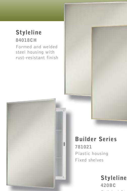
Styleline 84018CH Formed and welded steel housing with rust-resistant finish