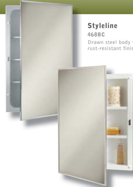
Styleline 468BC Drawn steel body with rust-resistant finish