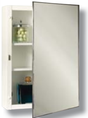
Topsider 26018CH Surface mount