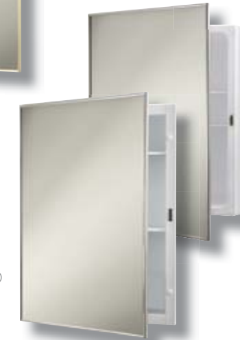
Styleline 614 Surface mount plastic housing