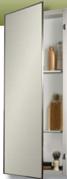
Styleline 840P34CH Formed and welded steel housing