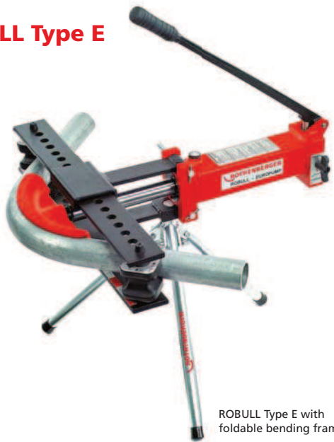
ROBULL Type E with foldable bending frame