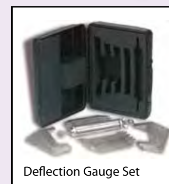
Deflection Gauge Set