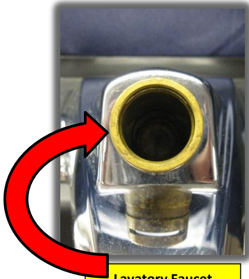
Lavatory Faucet Valve

After removing cartridge, we recommend cleaning the inside of the valve body (shown below) with a soft bristled nylon brush (e.g. old toothbrush), to remove any calcium build up. After cleaning, turn on water supply lines slightly to flush clean water through the open valve. We recommend placing a bowl or cup over top of valve ( for lavatory and kitchen faucets ) or under the valve body ( for shower faucets ) to redirect any water splash into the sink or tub/stall. This will help extend the life of the cartridge.