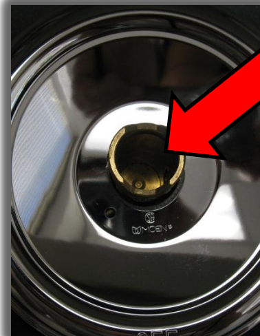
Shower Faucet Valve