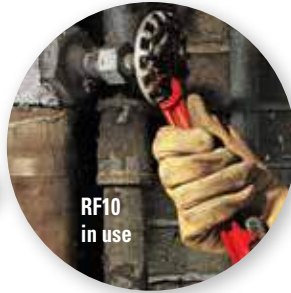
RF10 in use

Keep this lightweight 2-in-1 wrench handy all day!