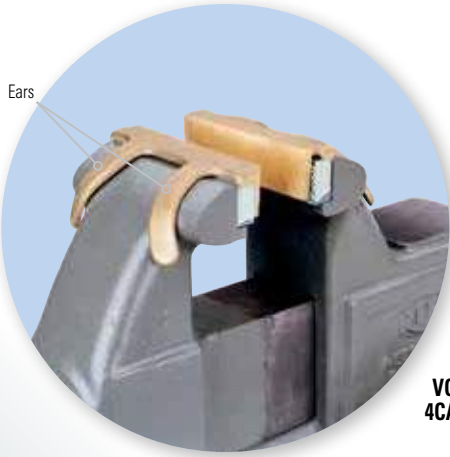
VC4 on 4CA vise