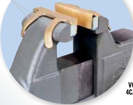
VC4 on 4CA vise