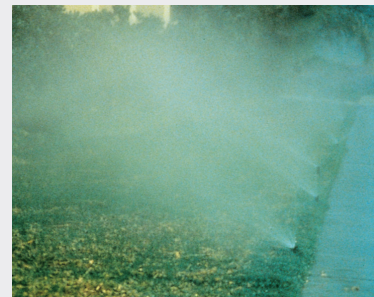
Without Pressure Regulation