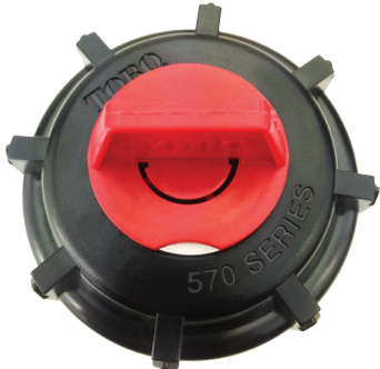
570Z & 570ZLP