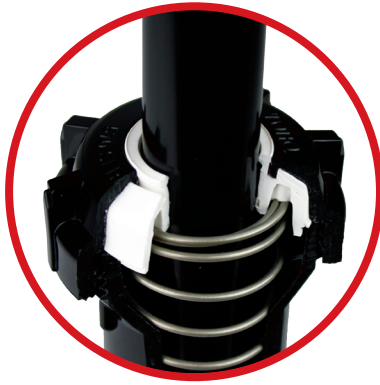
Enhanced Zero Flush Seal

No Water Wasted at System Start System start up is a critical time when water waste can occur. The Toro 570Z Series spray head's wiper seal is pressure-activated and prevents flow-by at start up, meaning no water is wasted and more heads can be installed on the same line.