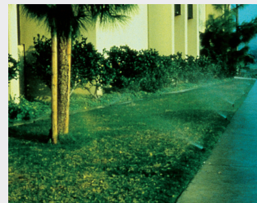
With Pressure Regulation