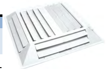
PLASTIC CEILING GRILLE