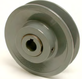
IRON VARIABLE (ADJUSTABLE) PULLEY