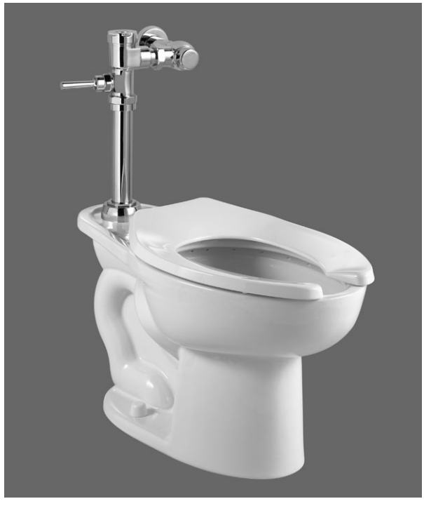
SEE REVERSE FOR ROUGHING-IN DIMENSIONS