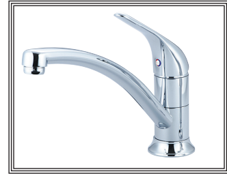
#2LG260 SHOWN * ADA