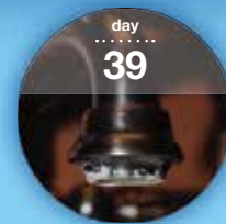
which will clog and corrode your home's plumbing.