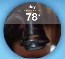
to renew the life and performance of your pipes, fixtures and appliances.