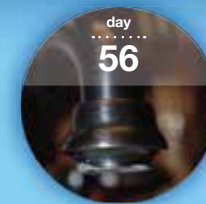
nuvoH2O is innovative by gradually removing existing scale...