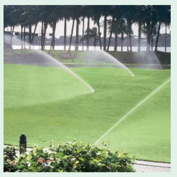
The ProSport has a minimum of 4-inch (10 cm) pop-up stroke. The sprinkler has a 1-inch female thread inlet.

The rotor has a friction-clutch mechanism to allow for 360°+ forward or reverse movement of nozzle turret without damage to the internal gear components. The ProSport incorporates an "arc memory clutch" feature to allow original arc pattern to be automatically resumed following disturbance of nozzle turret setting.