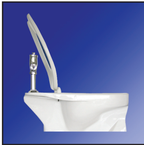
Self-Sustaining Check Hinge - External self-sustaining check hinge seat in any raised position up to 11 degrees beyond vertical