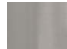
-04 Brushed Nickel Hardware