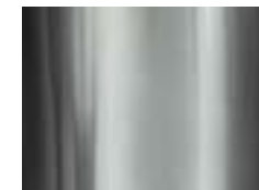
-01 Chrome Hardware