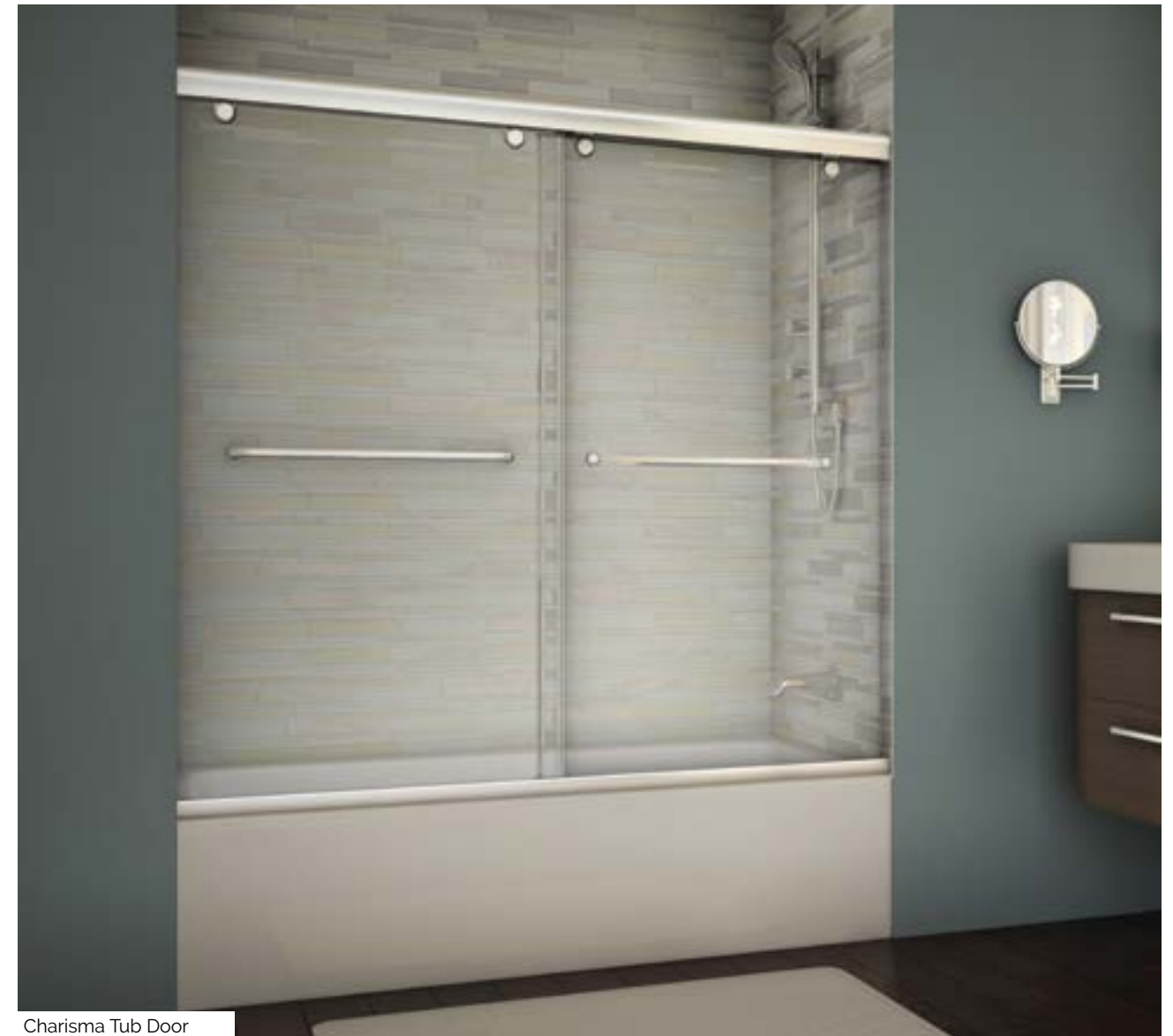
Charisma Tub Door