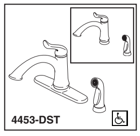
Submitted Model No.: Specific Features: