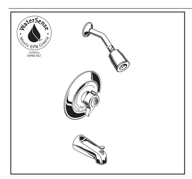
T375.128 Bath/Shower Trim Shown